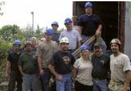
IBEW members from Locals 38 and 129 employed by South Shore Electric are working on construction of a new Giant Eagle Supermarket in Parma, OH.

L.U. 58 (em,i,rtb&spa), DETROIT, MI—So, brothers and sisters, are you better off today than you were four years ago? Did tax cuts for the rich create jobs for you? Has deregulation meant lower prices? Can working families survive another four