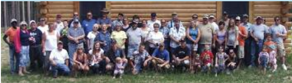
Local 322 members and their families attend the Casper, WY, picnic held Aug. 2 on Casper Mountain.