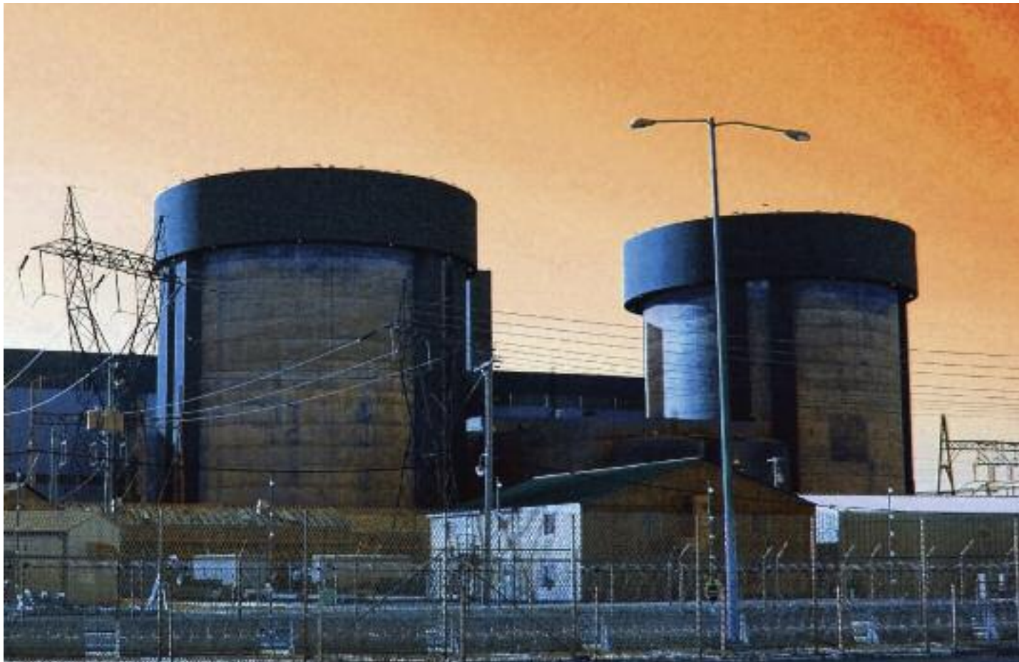
A study by the Nuclear Regulatory Commission said average radiation dosage levels at U.S. plants have dropped more than 60 percent in the last decade.

Exposure to radiation is an expected part of the job for the thousands of nuclear plant employees around the nation. But a new report says that radiation absorbed by workers has fallen to its lowest level ever.