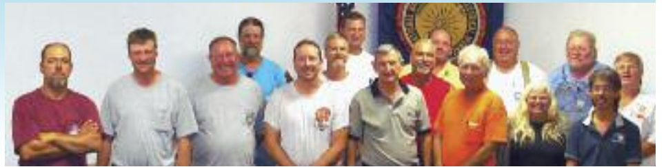
IBEW Local 270 newly elected officers.

L.U. 270 (i&o), OAK RIDGE, TN—The Local 270 election of officers was held June 21. We welcome all newly elected officers and thank everyone who participated and helped make our election a suc-