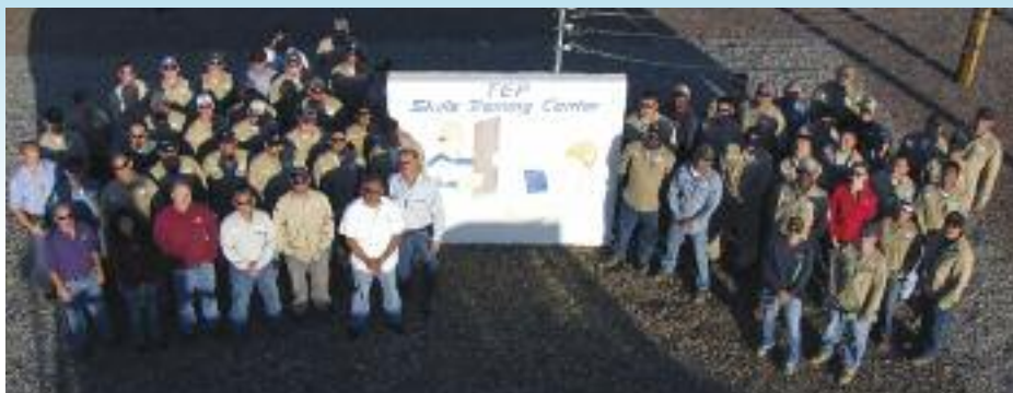
Local 1116 apprentices gather at the TEP Skills Training Center.